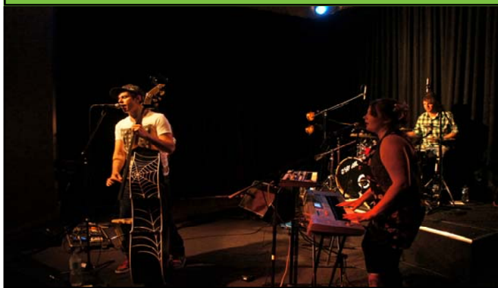
The Breakaways during their rocking set at The Station .